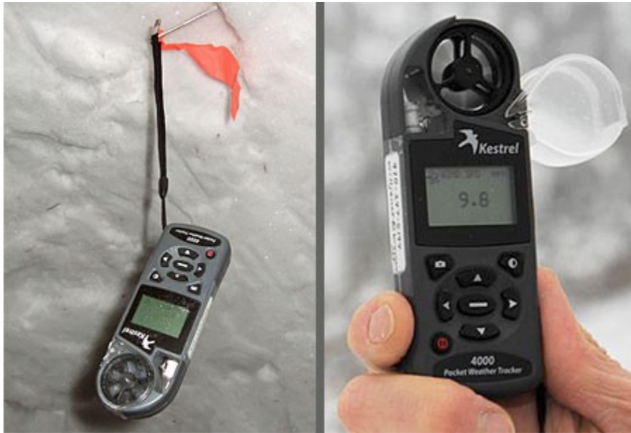
(Left) The Kestrel 4000 suspended from the ceiling of an igloo to record interior conditions. (Right) Measuring wind speed with the Kestrel.